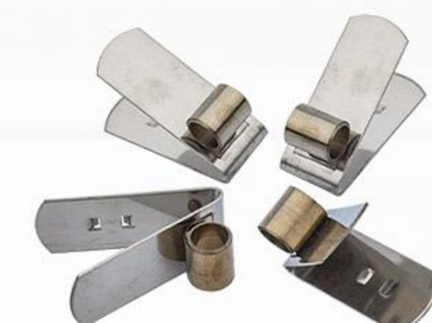
Carbon Brush Spring/Circlip

Designed for HangCha, reliable connection