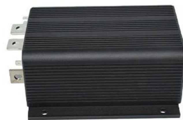
CURTIS Series Motor Controller

Comprehensive monitoring, safety and security