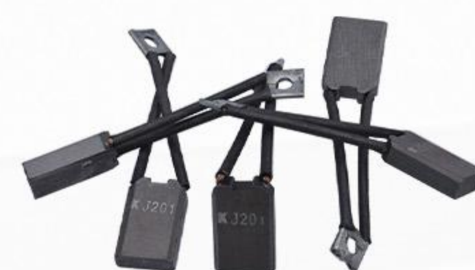
OEM Motor Carbon Brushes