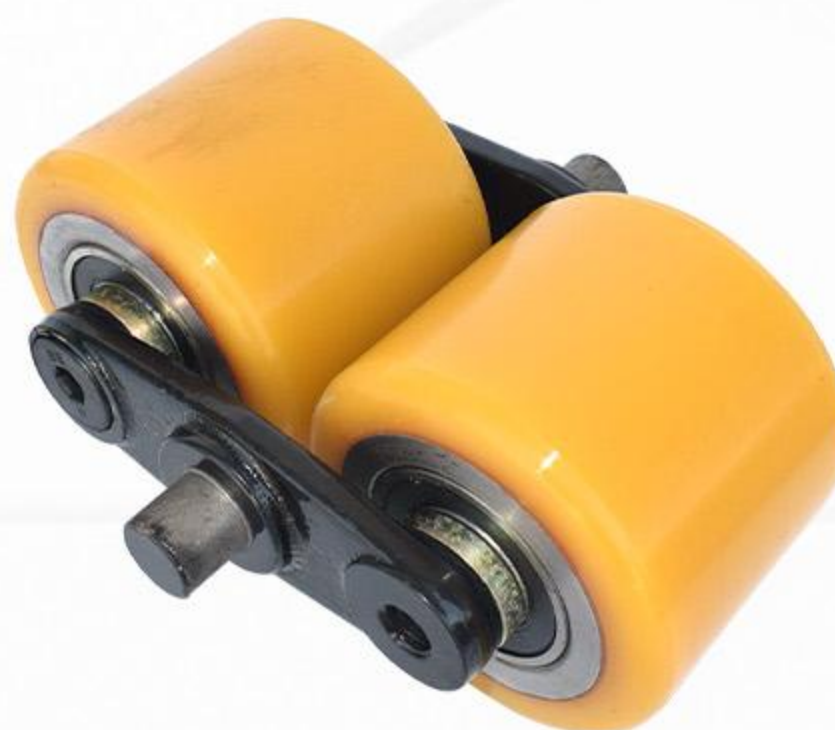
Load Wheel Assembly And Accessories

Improved stability and longer service life