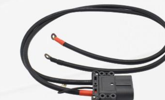
Hangcha Forklift Power Connecting Cable

Designed for HangCha, reliable connection