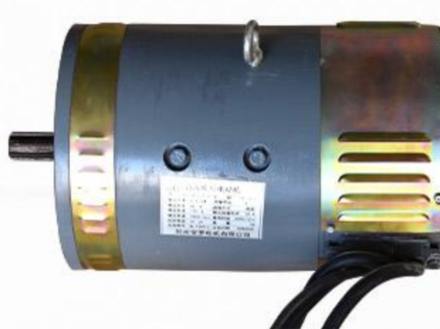
Separately excited Motor

High performance, low energy consumption