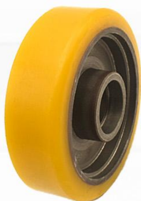
Electric Forklift Auxiliary Wheels