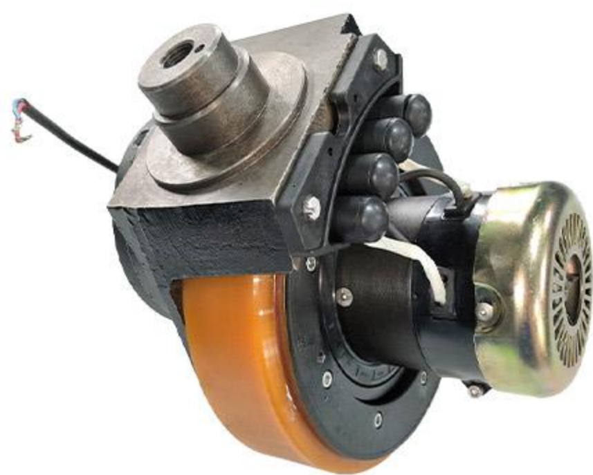
Permanent Magnet Drive Motor Assembly

High performance, low energy consumption