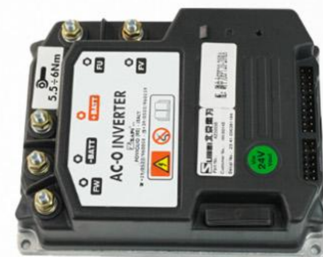
ZAPI AC Controller