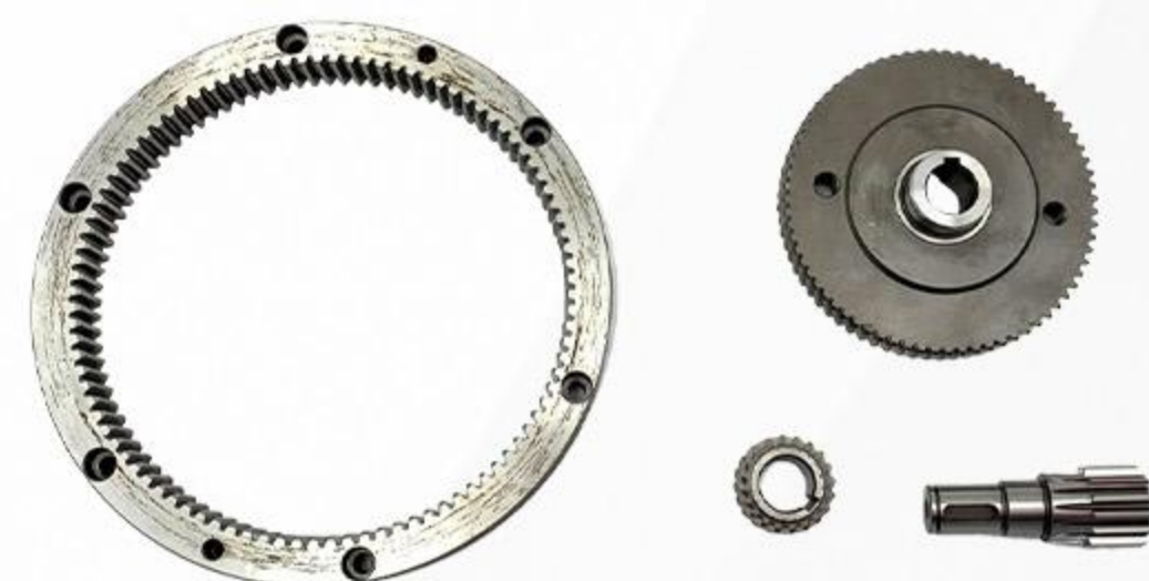
Transmission Repair Kits

Complete accessories for guaranteed performance