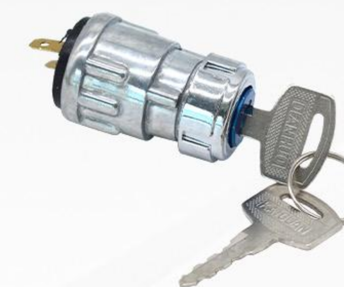
Key Switch/Ignition Switch