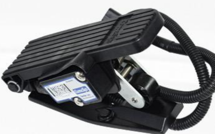
COMESYS Foot Pedal