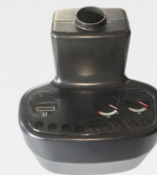
Diesel Forklift Instrument Assembly

Designed for electric forklifts, high efficiency