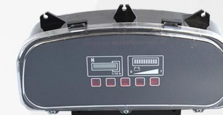
HELI Electric Forklift Instrument

Designed for electric forklifts, high efficiency