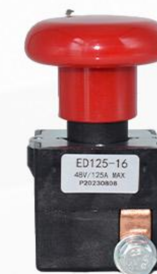
Pallet Truck Emergency Stop Switch

Quickly cut off the power supply in case of emergency