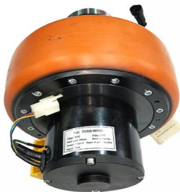
AC Drive Motor Assembly

High performance, low energy consumption