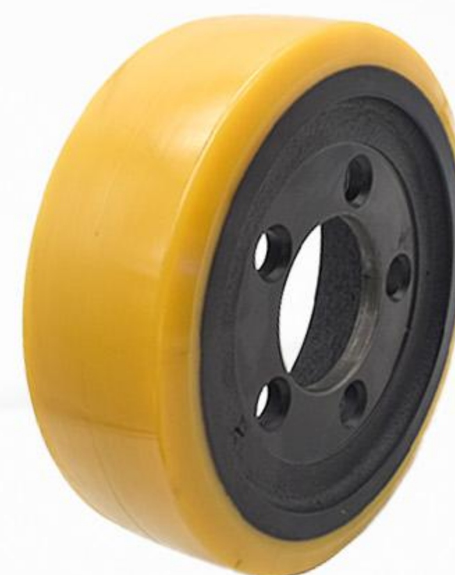
Electric Forklift Drive Wheels

High load carrying capacity and durability