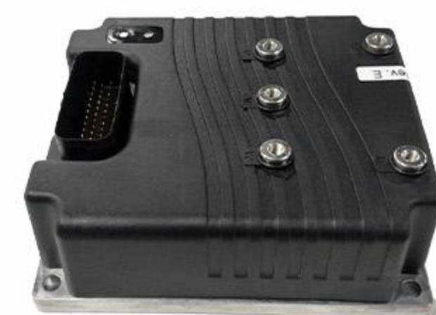
CURTIS AC Controller