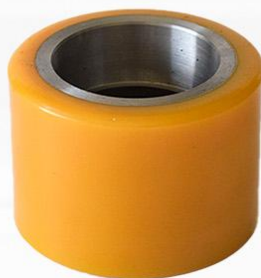
Electric Forklift Load Wheels