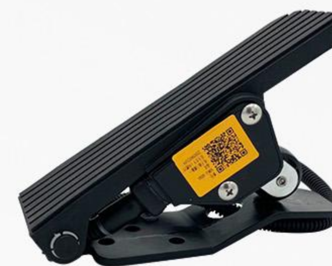
Electronic Accelerator Pedal

Precise control and comfortable operation