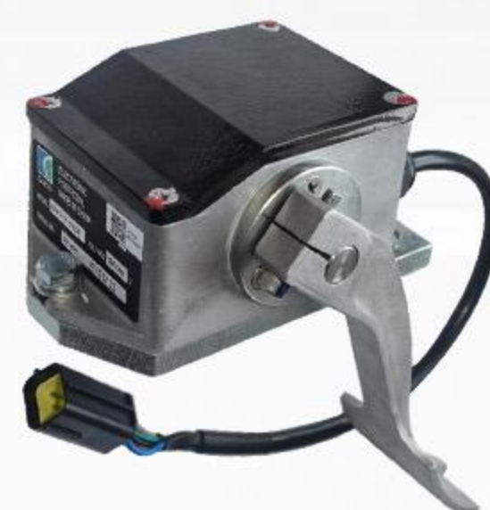
EFP Foot Pedal