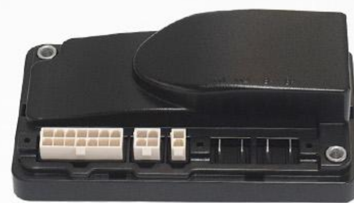
Pallet Truck Drive Controller

Highly efficient control, safe and stable