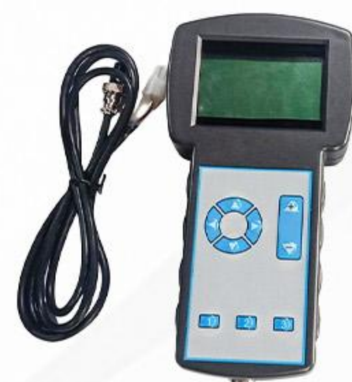
Programmable & Handheld Programmable