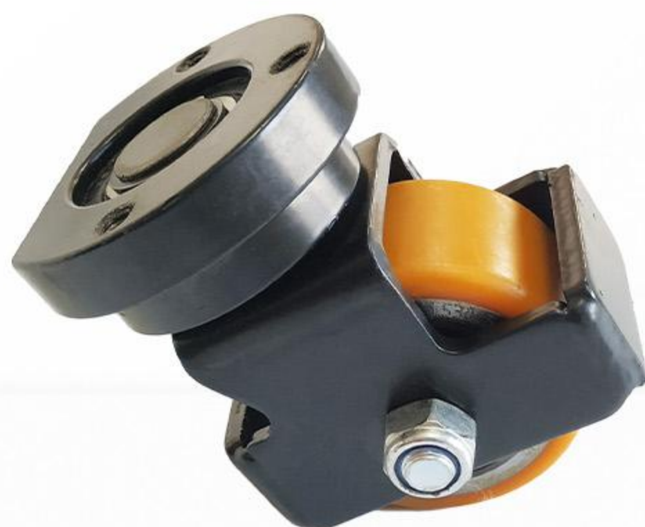
Auxiliary Wheel Assembly And Accessories

Improved stability and longer service life